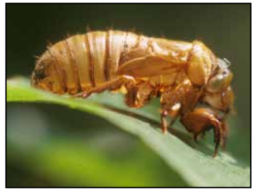
Cicada exoskeleton after molting.

Scientists have catalogued about 1.5 million species of organisms. What group of organisms do you think accounts for the majority of this bounty? Rodents? Birds? Plants? Guess again. Insects make up about two-thirds of this rich diversity. Scientists estimate the total number of species on Earth is closer to 9 million, with about 90% of them belonging to the class Insecta. There are more species of insects than any other kind of creature. If we compared weights on a scale, insects would outweigh all other creatures combined. But this most diverse group in the animal kingdom is also the most feared and hated.